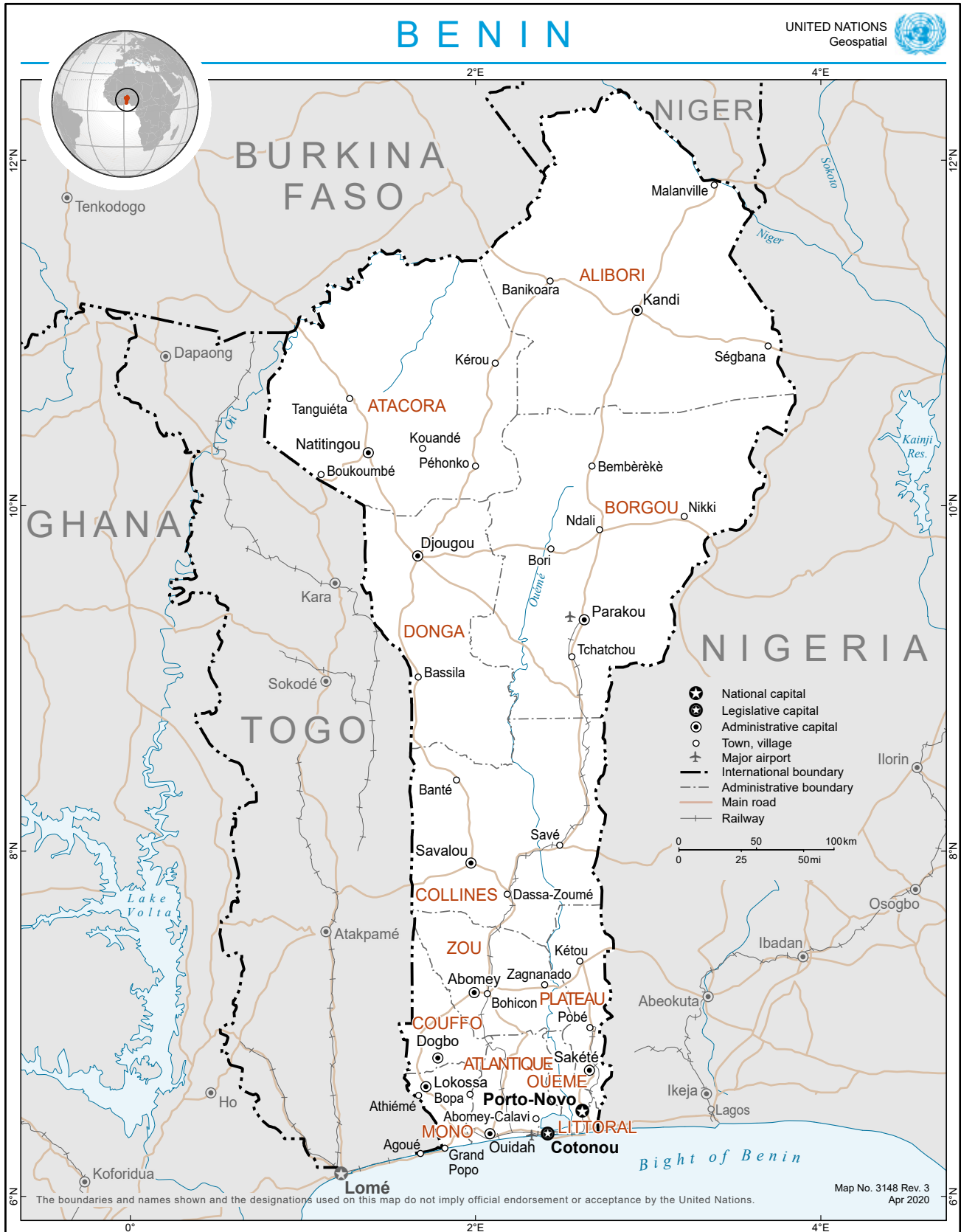
Figure 2. Map of Benin showing the towns of Malanville in the north-east on the Cotonou-Niamey road corridor with the Republic of Niger and Porga in north-west on the Cotonou-Ouagadougou road corridor with the Republic of Burkina Faso