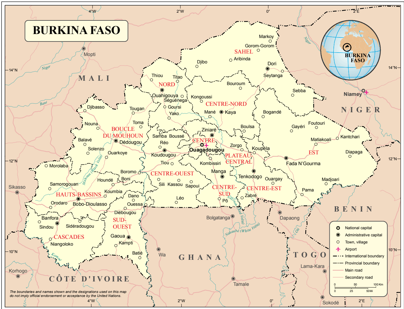
Figure 3. The map of Burkina Faso showing some of the customs border posts with neighbouring countries