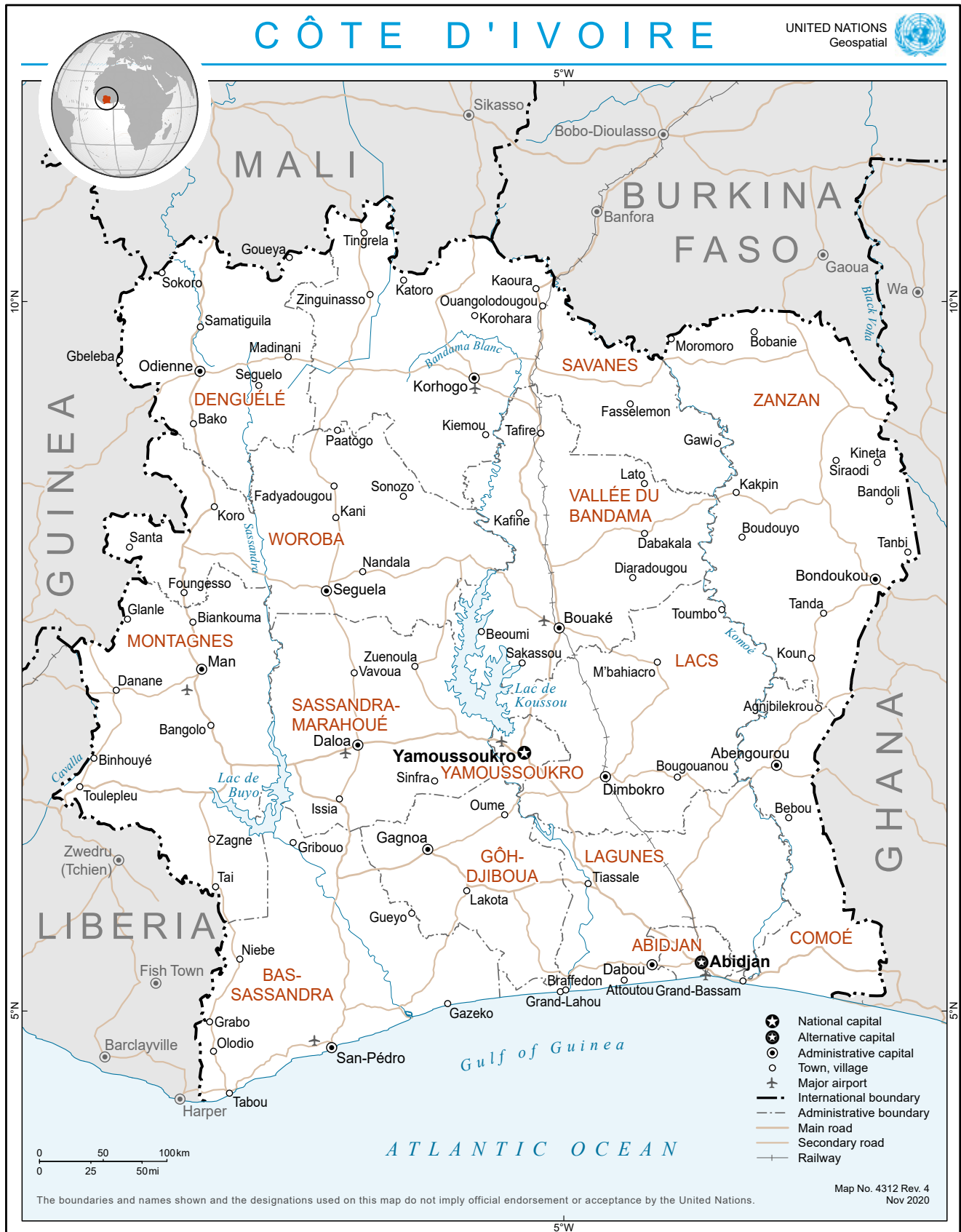
Figure 4. Map of Côte d'Ivoire showing Ouangolodougou and neighbouring member States – Mali and Burkina Faso to the north; Ghana to the east and Liberia and Guinea to the west