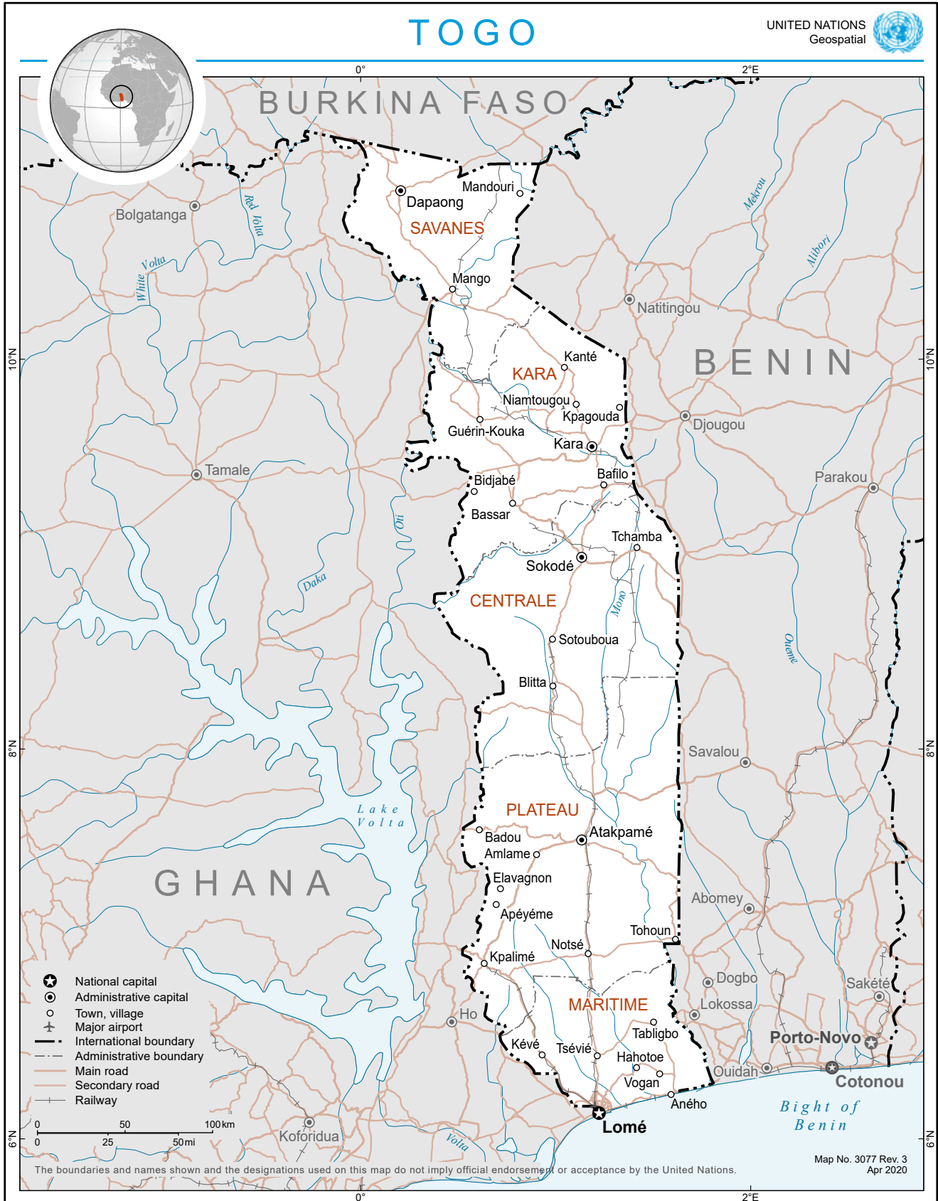
Figure 6. Map of the Republic of Togo showing the major international roads/transit corridors with the neighbouring countries of Ghana on the left, Benin on the right and Burkina Faso in the north