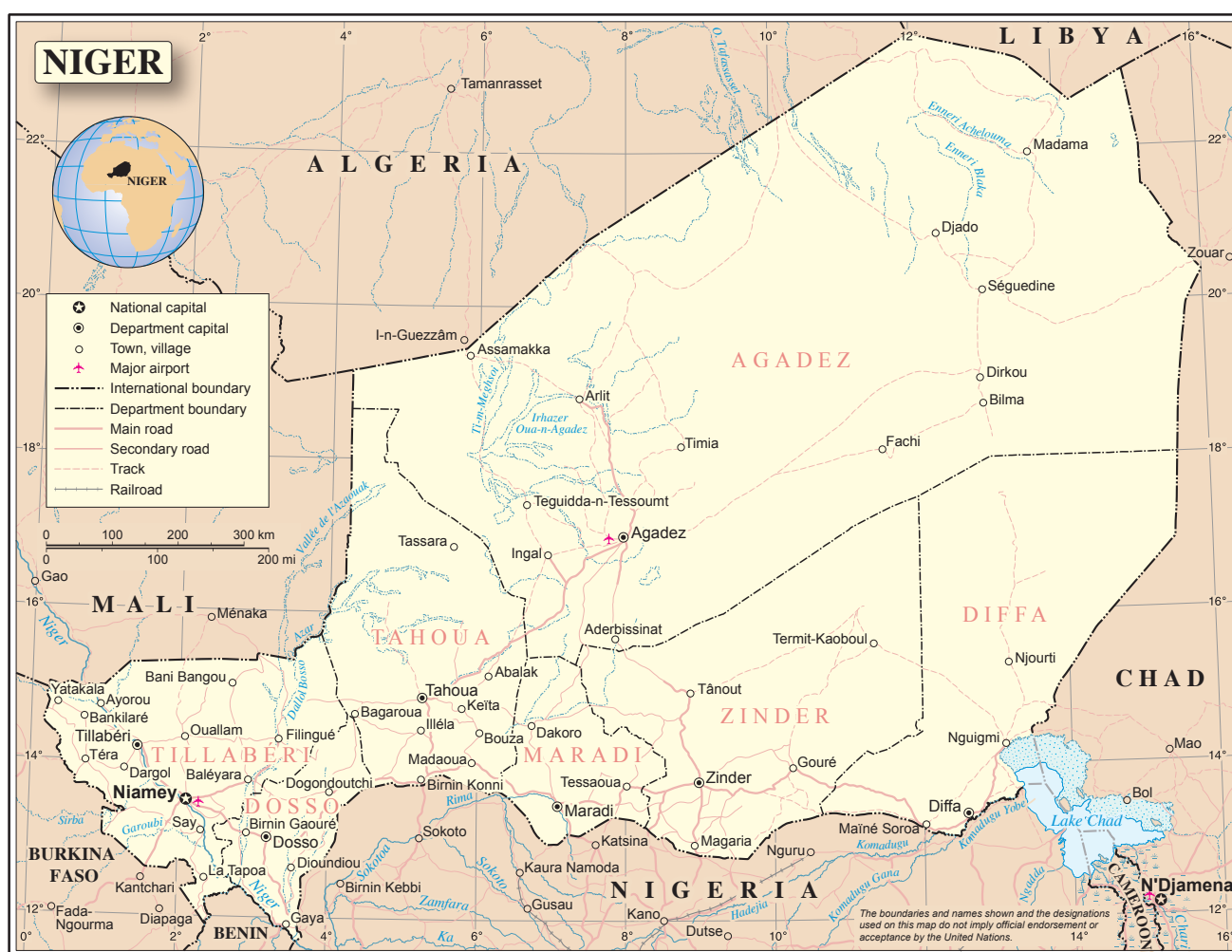
Figure 5. Map of Niger showing some of the border posts on the transit corridors with the neighbouring ECOWAS member States of Benin, Burkina Faso, Mali and Nigeria