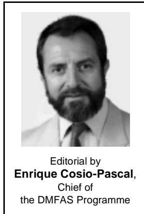
Editorial by Enrique Cosio-Pascal , Chief of the DMFAS Programme

Four countries, in 1981, formed the initial pool that allowed the development of the first DMFAS version. The development of a CBDMS is a complex matter, for many reasons. Let me give only two major examples here. First, each creditor has its own methodology to calculate accrued interest, fees and rounding for the